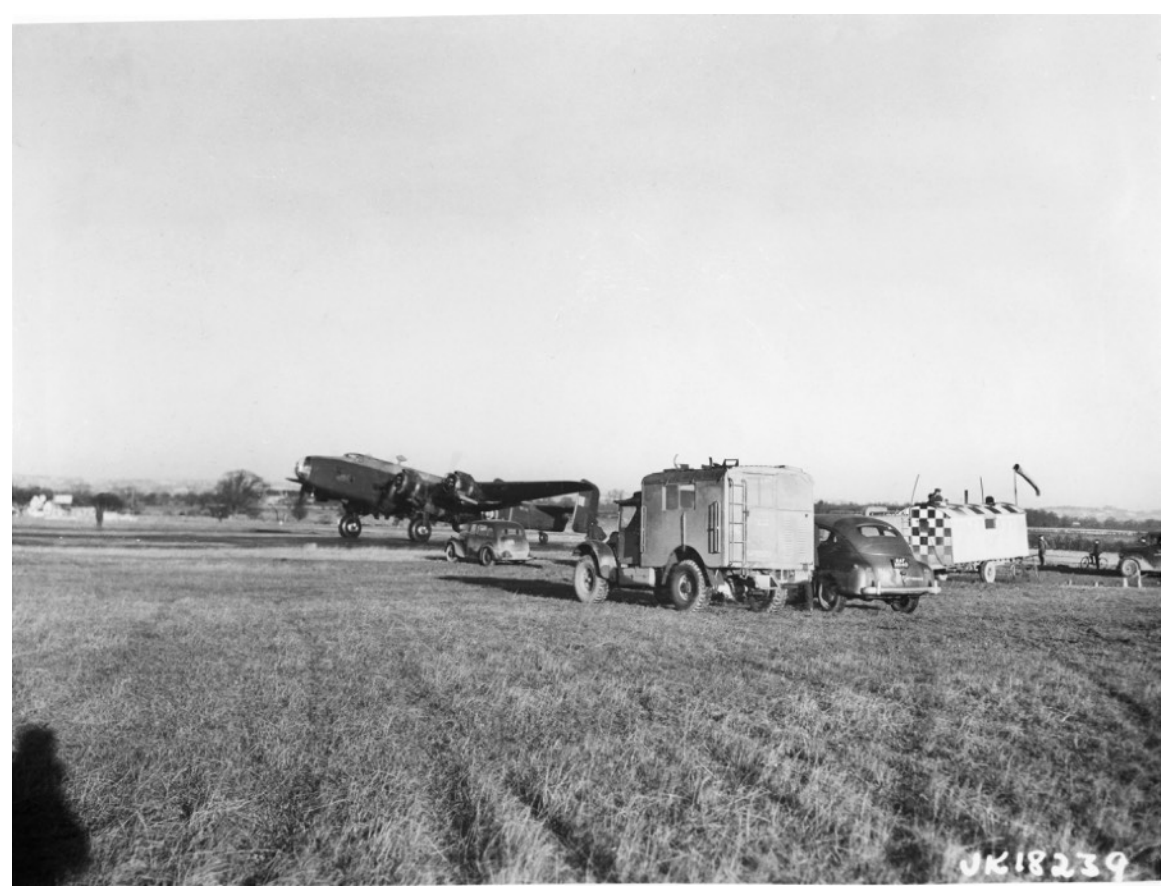
A photograph of a Halifax Bomber coded PT-T. According to his Flying Log, On February 3 1944, Dad flew circuits and landings for 3:00 daytime hours in a Halifax Bomber identified as PT-T, piloted by F/S (Raymond) Leonard, and cross country for 4:20 hours night time on February 7 1944.